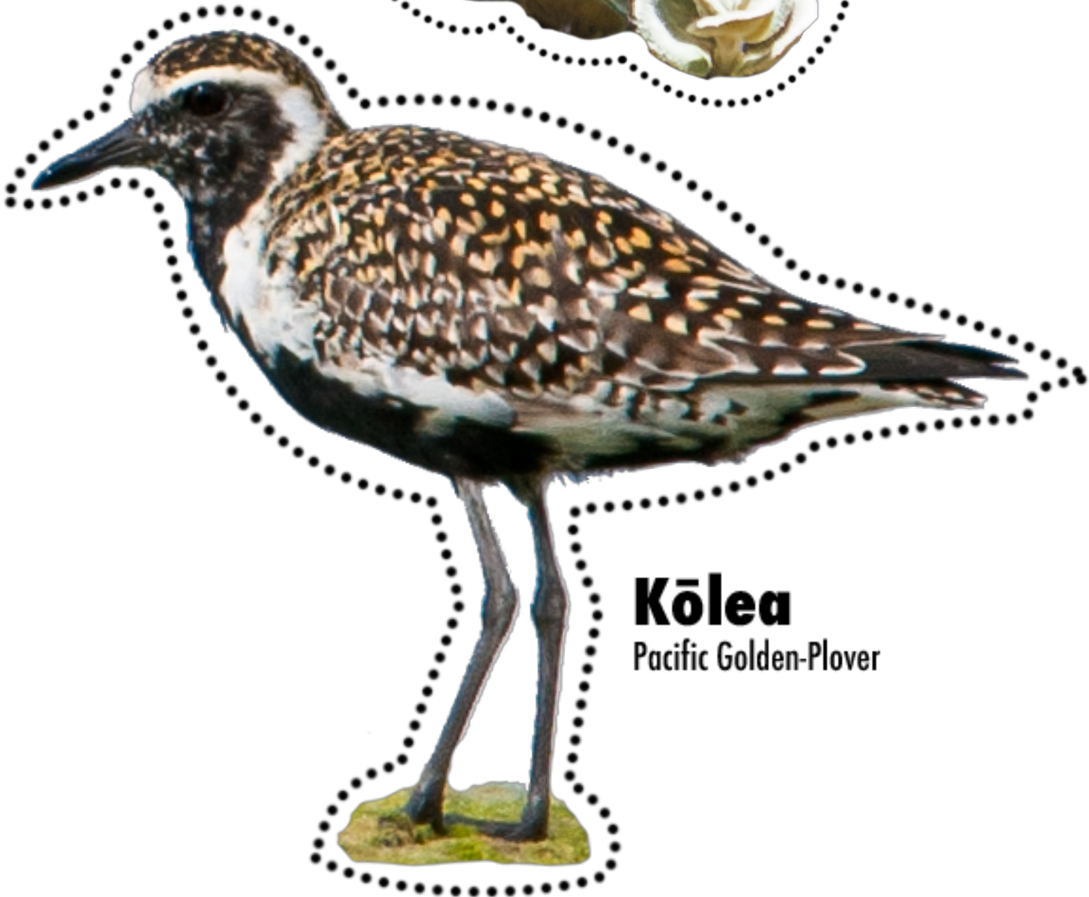
Kōlea Pacific Golden-Plover